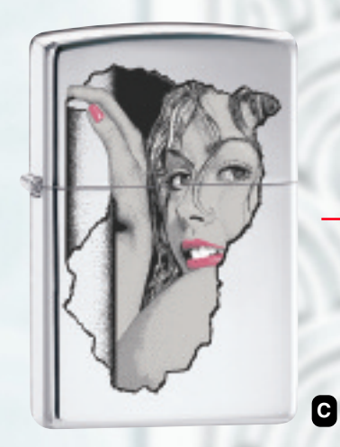
No. 20713 Seductive Stare High Polish Chrome Suggested Retail: $29.95