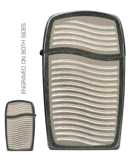
30032 CHANNELED Laser and rotary engraved diamond drawn fill patterns accentuate the sweeping

curve of the lid line. New Shadow finish.