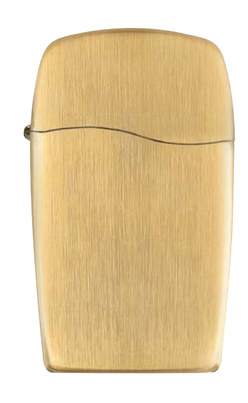
30002 VERTICAL GOLD Burnished 18-karat gold plate. Hand buffing makes each lighter unique.