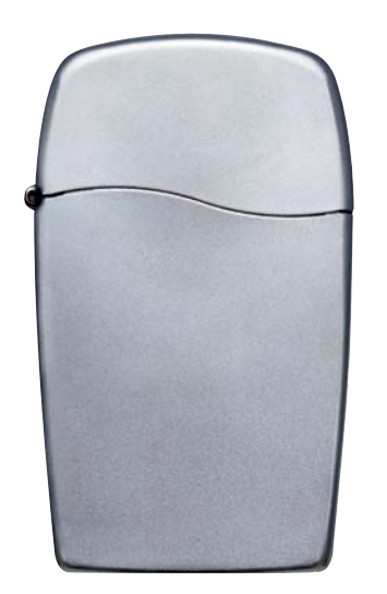
30027 DUSTED CHROME Bead-blasted brass lighter, chrome plated. A dazzling new look.

curve of the lid line. New Shadow finish.