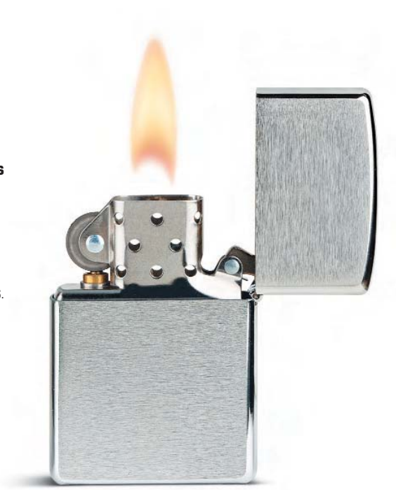
• ORIGINAL ZIPPO LIGHTER, LIQUID FUEL