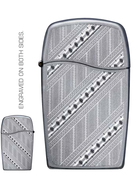
CHROME PATHWAYS Dusted Chrome lighter sparkles with an elegant diamond carved diagonal bracelet pattern contrasted with vertical scallops.