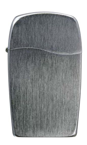
30001 VERTICAL CHROME Brushed chrome hand buffed to a satin sheen. Each lighter is a unique and beautiful work of art.