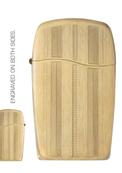
30005 GOLD TUXEDO 18-karat gold plate lighter with diamond carved scallops and alternating herringbone bands.