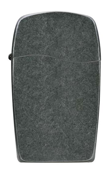
30004 SHADOW Zippo's newest basic black solid brass lighter is media finished, then plated with dark chrome.