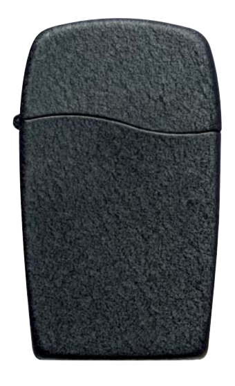
30013 SABLE Rich, textured black finish enhances the tactile appeal of this understated lighter.