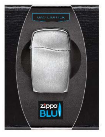
READY FOR DISPLAY.