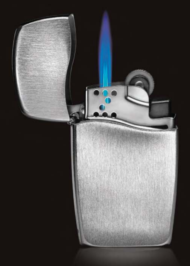
75 YEARS OF PASSION. NOW AVAILABLE IN BLUE.