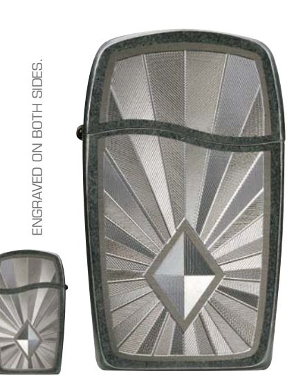
30031 MESMERIZED Shadow lighter with a diamond drawn starburst. Rotary and laser engraved on dark chrome.