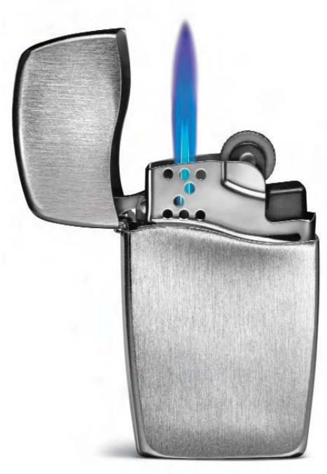
• NEW ZIPPO BLU™ LIGHTER, BUTANE GAS FUEL