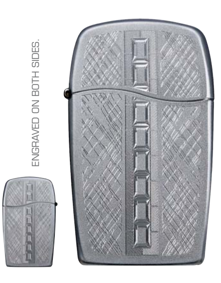
30030 ZIPPED Dusted Chrome is embellished with an etched background highlighted by a diamond carved herringbone accent.